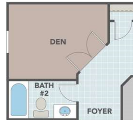
Optional Den with Double Doors