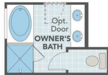
Optional Owner's Bath