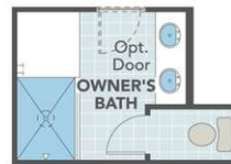
Optional Walk-in Shower