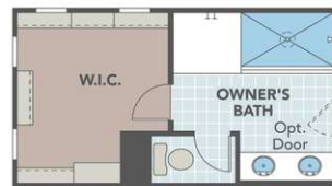
Optional Walk-in Shower