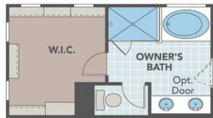
Optional Owner's Bath