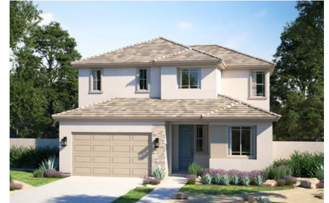
DESERT PRAIRIE ELEVATION