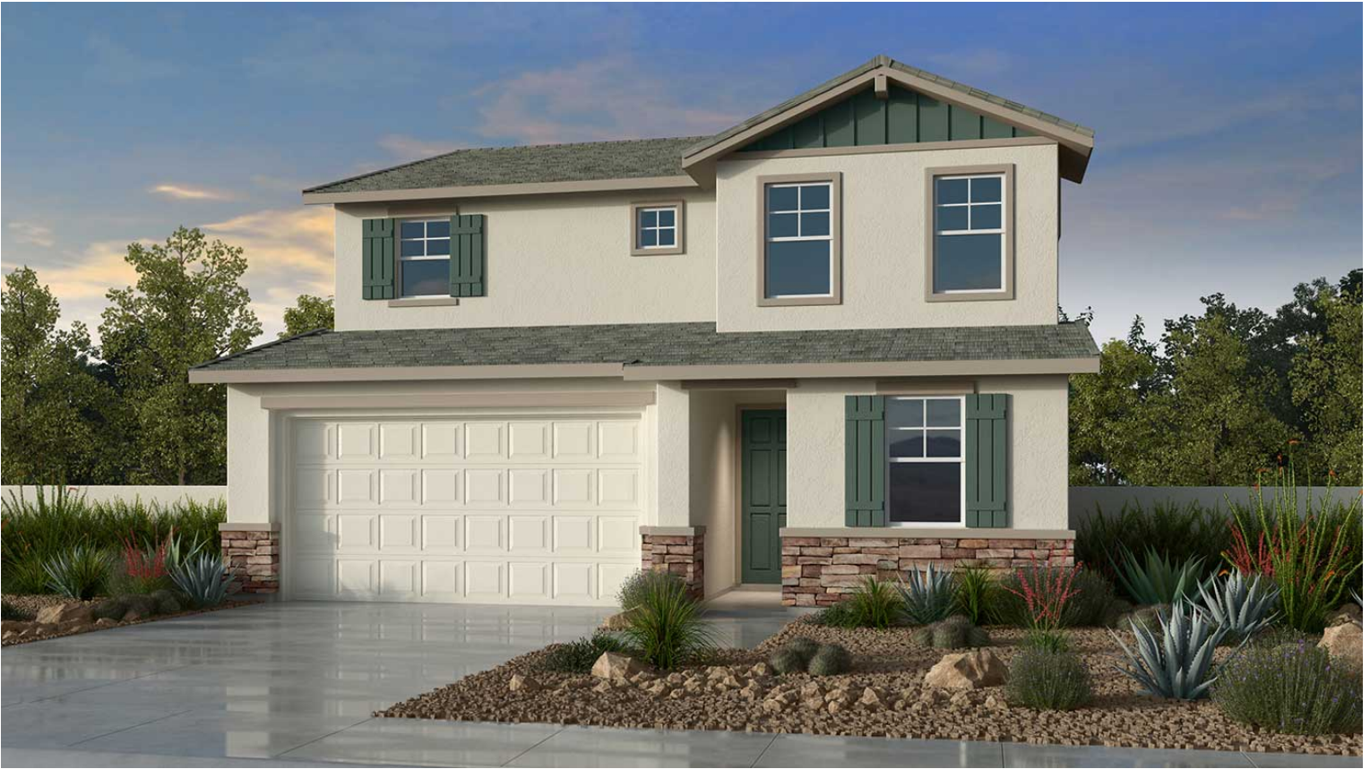
Exterior B – Ranch Territorial