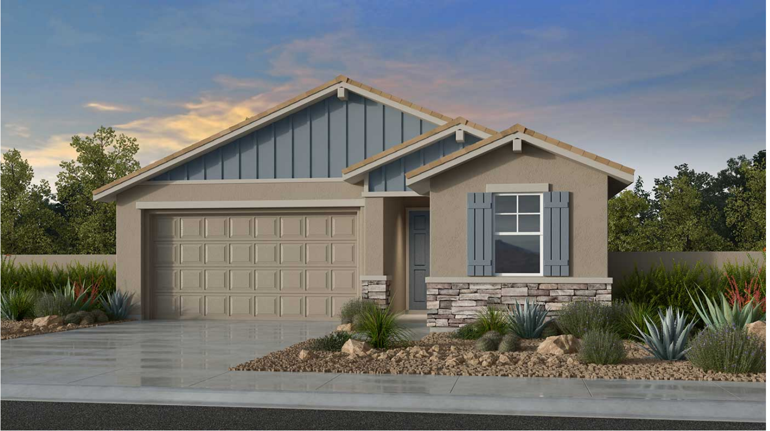
Exterior B – Ranch Territorial