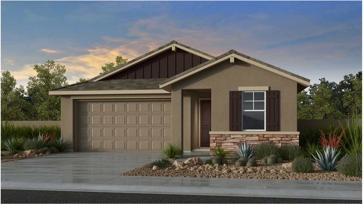
Exterior B – Ranch Territorial