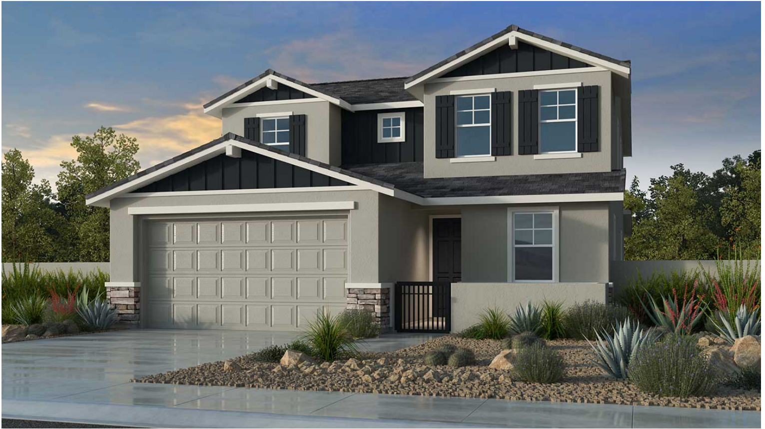
Exterior B – Ranch Territorial