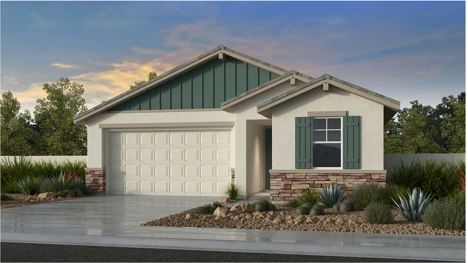
Exterior B – Ranch Territorial