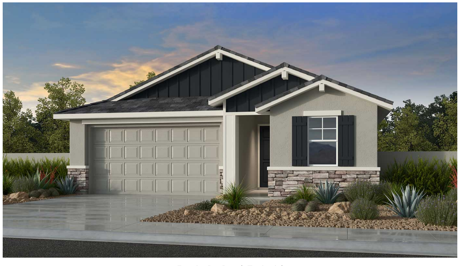
Exterior B - Ranch Territorial