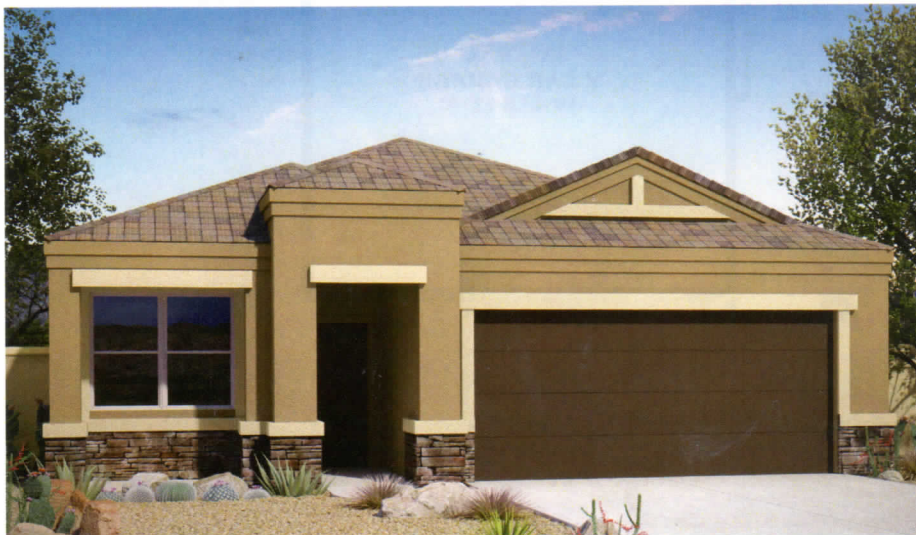
Elevation C Standard LedgeStone Available