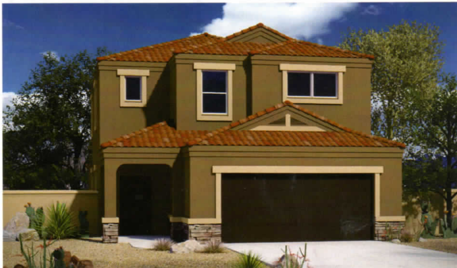
Elevation C Shown with Standard Color Blocking Standard LedgeStone Available