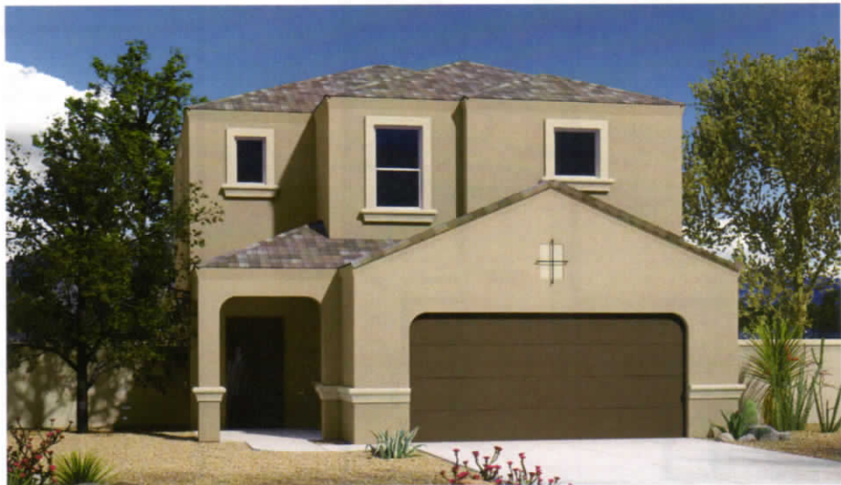
Elevation B Shown with Standard Color Blocking