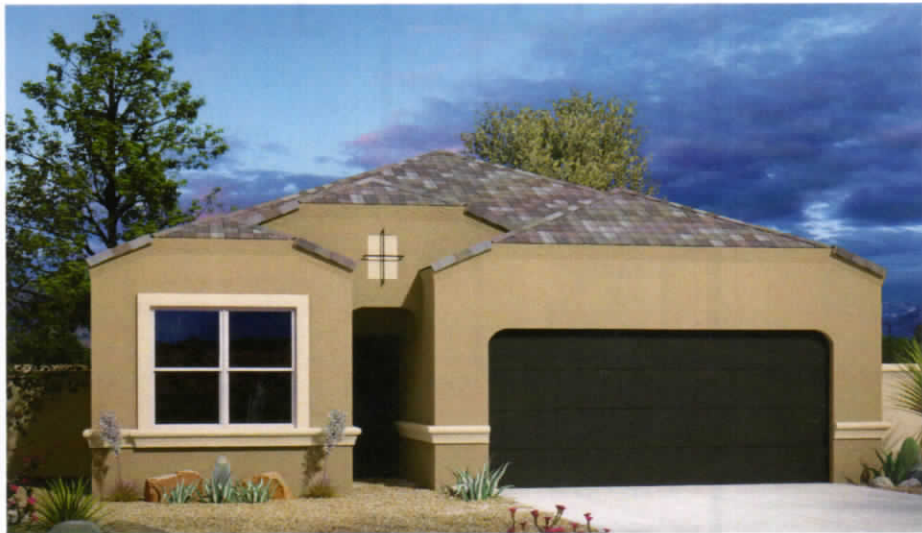
Elevation B Shown with Standard Color Blocking