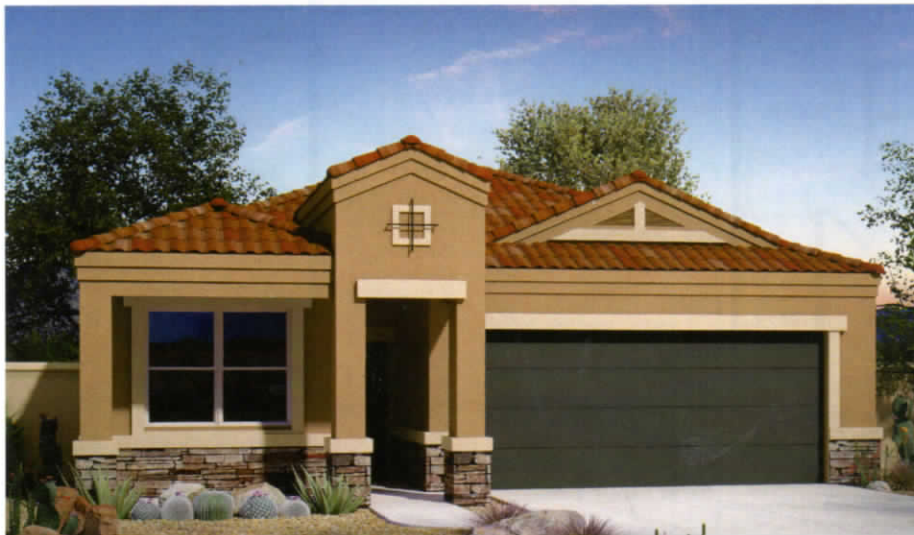
Elevation C Shown with Standard Color Blocking Standard LedgeStone Available