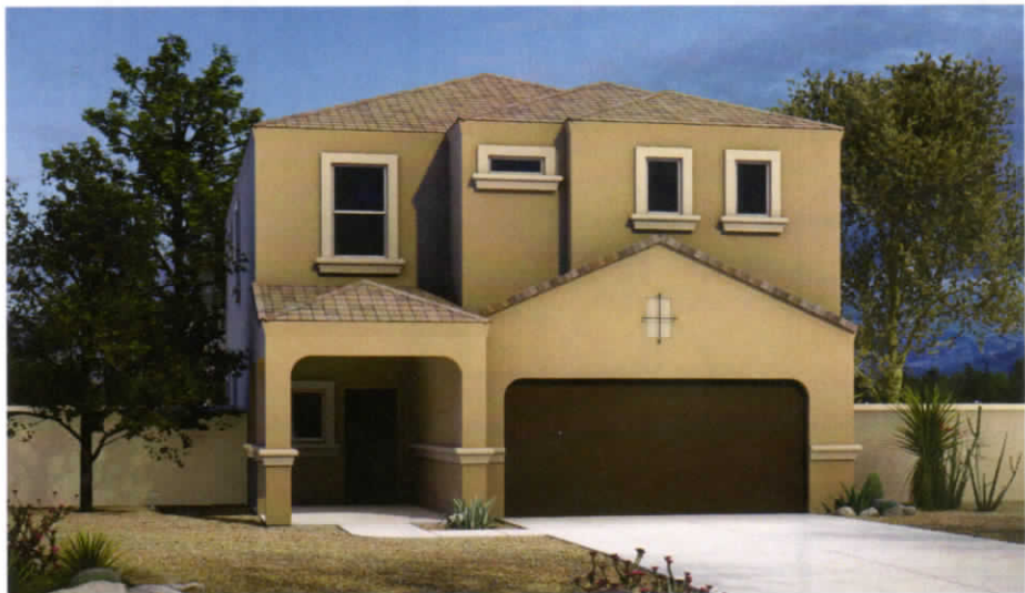
Elevation B Shown with Standard Color Blocking