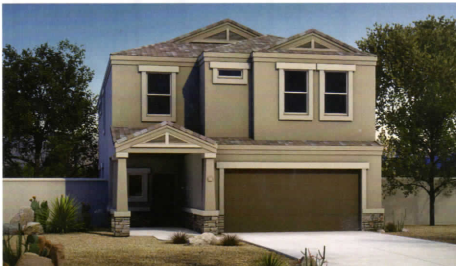
Elevation C Shown with Standard Color Blocking Standard LedgeStone Available