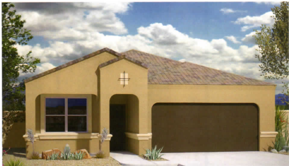
Elevation B Shown with Standard Color Blocking