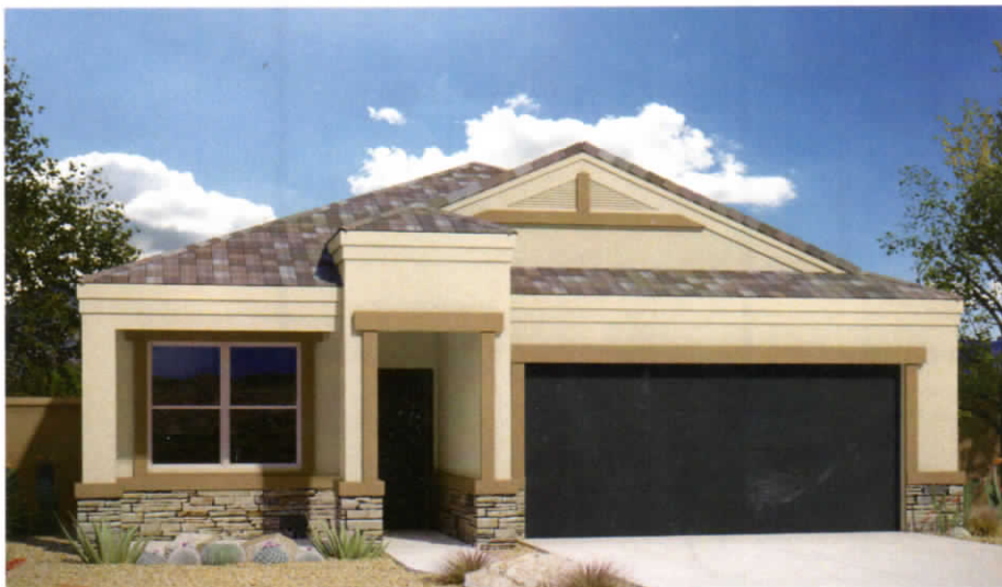
Elevation C Shown with Standard Color Blocking Standard LedgeStone Available