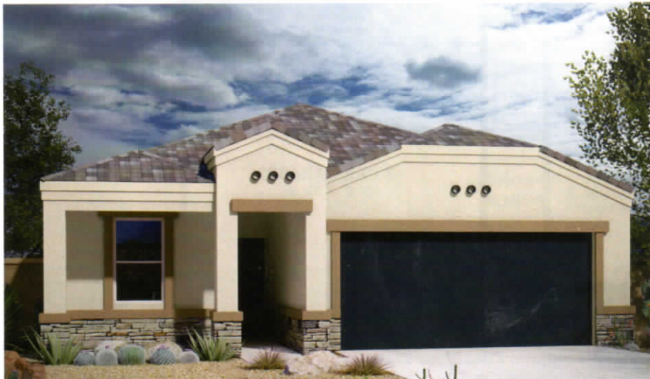
Elevation C Shown with Standard Color Blocking Standard LedgeStone Available