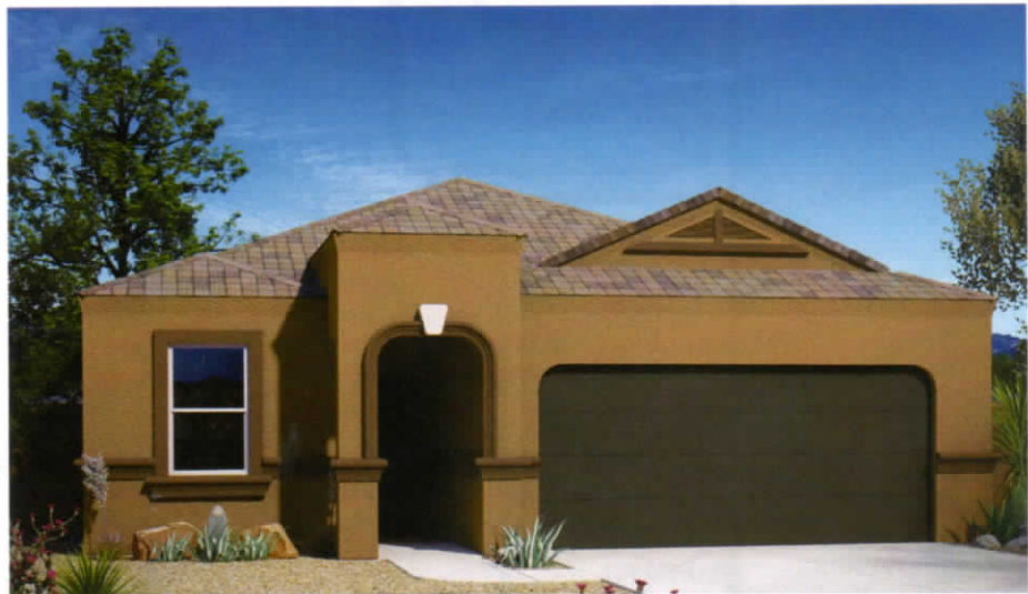
Elevation B Shown with Standard Color Blocking