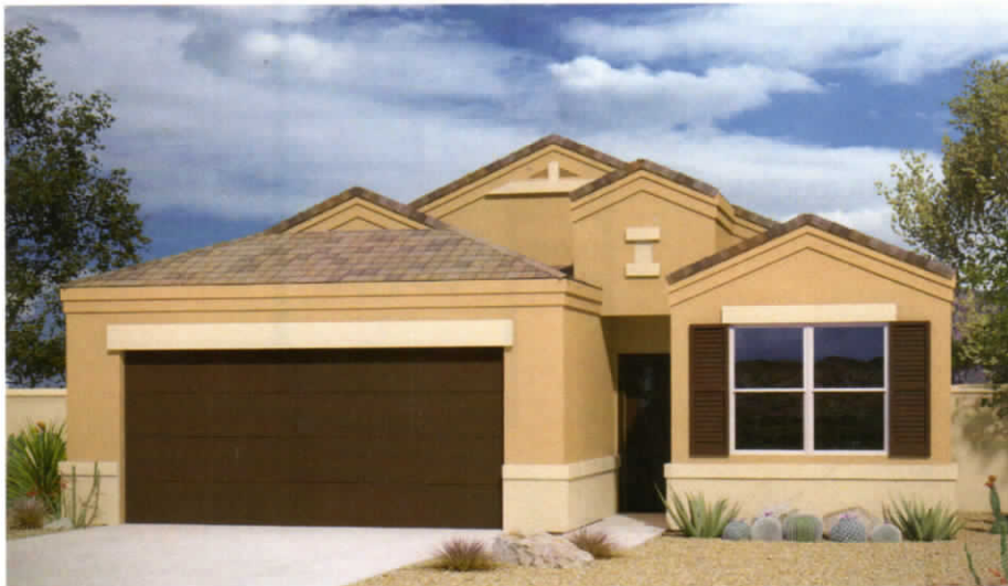
Elevation C Shown with Standard Color Blocking Standard LedgeStone Available