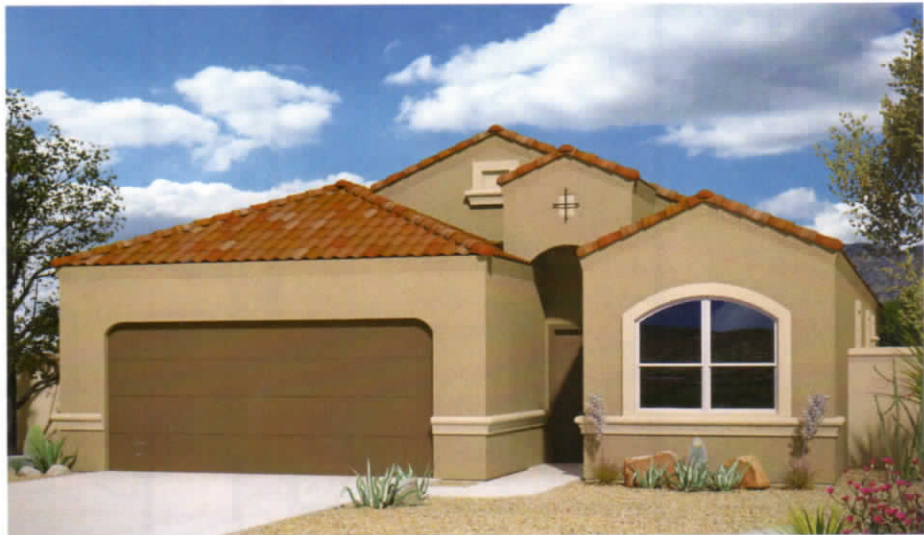
Elevation B Shown with Standard Color Blocking