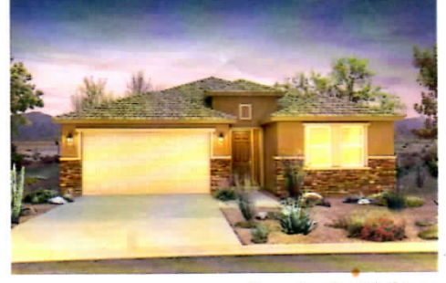
Elevation C with Stone