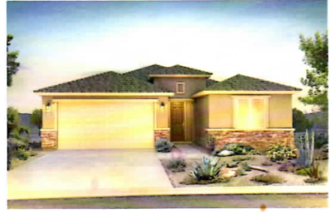
Elevation C with Stone