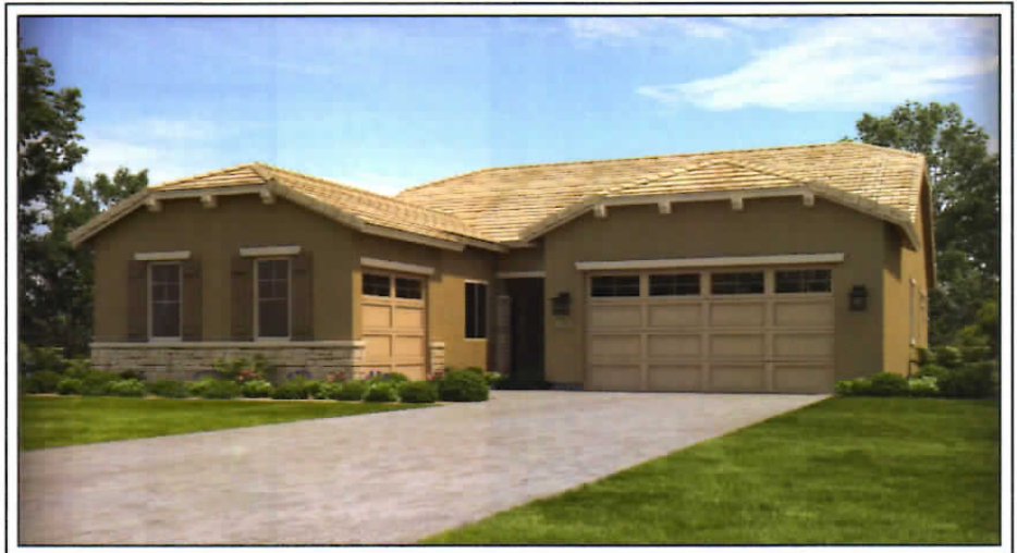
— The Oracle C —