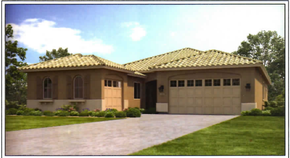
— The Oracle B —