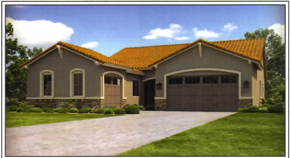
— The Oracle D —

15019 S 185th Avenue Goodyear, AZ 85338 800-864-1058 Lennar.com