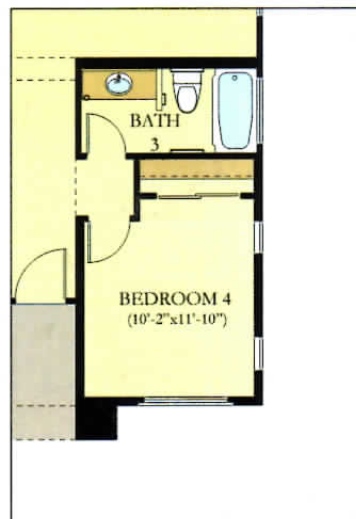
OPT. BEDROOM 4 I.L.O. DEN