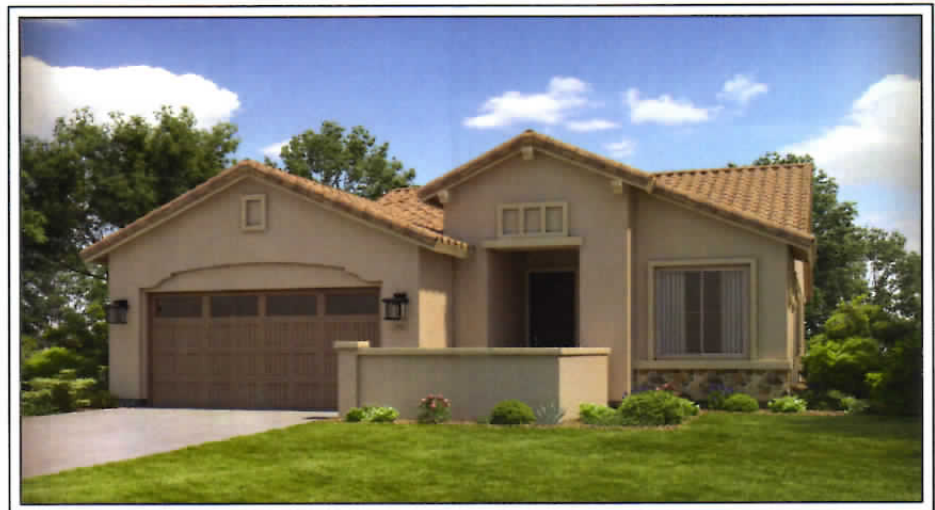
— The Barbosa D —