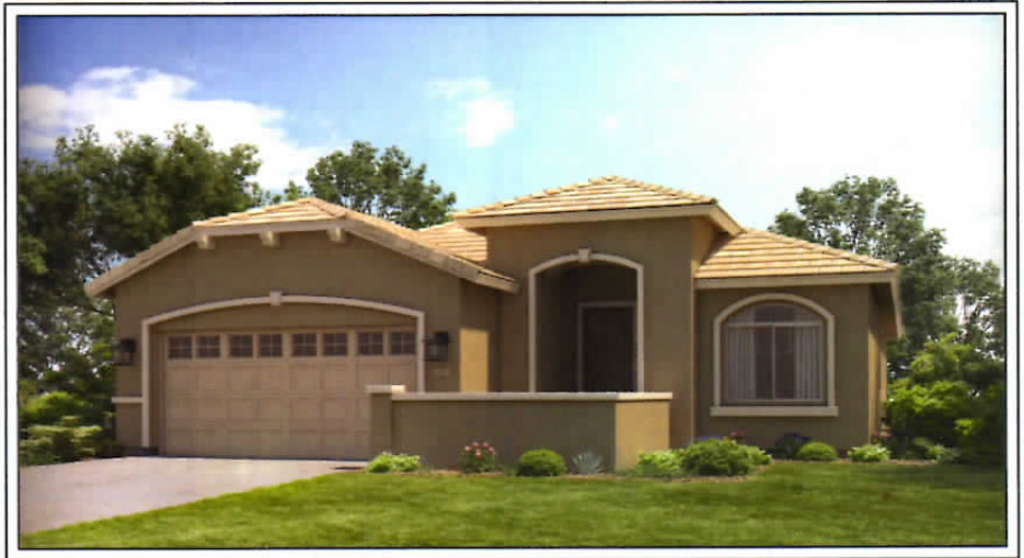
— The Barbosa B —

15019 S 185th Avenue Goodyear, AZ 85338 800-864-1058 Lennar.com