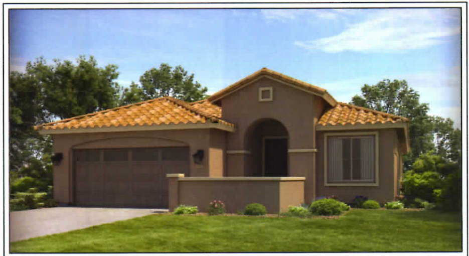
— The Barbosa C —