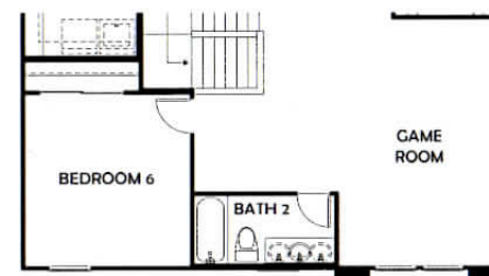
OPT. BEDROOM 6 WITH FULL BATH