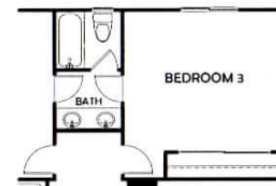
OPT. JACK AND JILL BATH