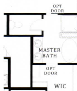
Optional Separate Tub & Shower