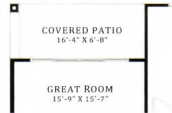
Optional 12' Sliding Glass Door at Covered Patio

D.R. Horton is an Equal Housing Opportunity Builder. Home and community information, including pricing, included features, terms, availability and amenities, are subject to change and prior sale at any time without notice or obligation. Pictures, photographs, colors, features, and sizes are for illustration purposes only and will vary from the homes as built. Square footage dimensions are approximate. Buyer should conduct his or her own investigation of the present and future availability of school districts and school assignments. D.R. Horton has no control or responsibility for any changes to school districts or school assignments should they occur in the future.