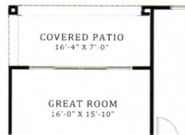
Optional 12' Sliding Glass Door at Covered Patio

Home and community information, including pricing, included features, terms, availability and amenities, are subject to change and prior sale at any time without notice or obligation. Pictures, photographs, colors, features, and sizes are for illustration purposes only and will vary from the homes as built. Square footage dimensions are approximate. Buyer should conduct his or her own investigation of the present and future availability of school districts and school assignments. D.R. Horton has no control or responsibility for any changes to school districts or school assignments should they occur in the future.