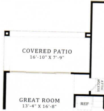
Optional 12' Sliding Glass Door