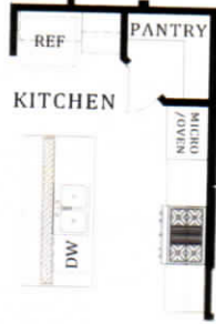
Optional Gourmet Kitchen