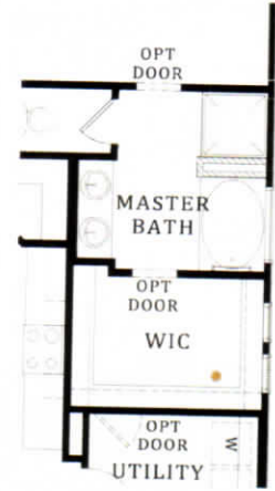
Optional Separate Tub & Shower