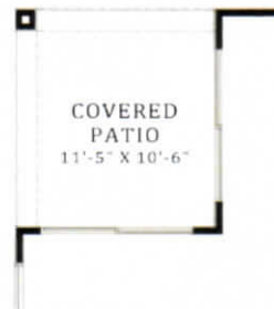
Optional 8' Sliding Glass Door at Great Room

D.R. Horton is an Equal Housing Opportunity Builder. Home and community information, including pricing, included features, terms, availability and amenities, are subject to change and prior sale at any time without notice or obligation. Pictures, photographs, colors, features, and sizes are for illustration purposes only and will vary from the homes as built. Square footage dimensions are approximate. Buyer should conduct his or her own investigation of the present and future availability of school districts and school assignments. D.R. Horton has no control or responsibility for any changes to school districts or school assignments should they occur in the future.