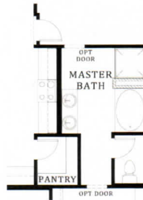
Optional Separate Tub & Shower at Master Bath