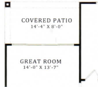
Optional 12080 Sliding Glass Door at Covered Patio