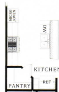
Optional Gourmet Kitchen

D.R. Horton is A Equal Housing Opportunity Builder. Home and community information, including pricing, included features, terms, availability and amenities, are subject to change and prior sale at any time without notice or obligation. Pictures, photographs, colors, features, and sizes are for illustration purposes only and will vary from the homes as built. Square footage dimensions are approximate. Buyer should conduct his or her own investigation of the present and future availability of school districts and school assignments. D.R. Horton has no control or responsibility for any changes to school districts or school assignments should they occur in the future.