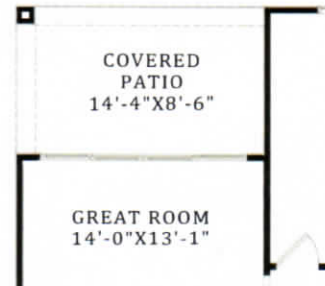
Optional 12' Sliding Glass Door at Covered Patio