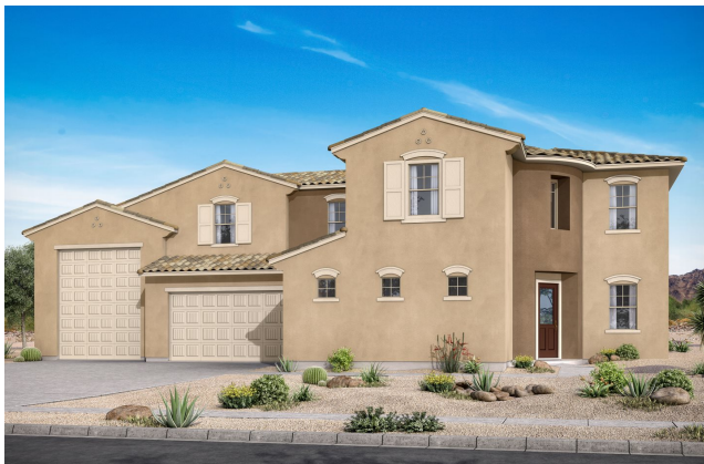
Elevation Spanish with optional RV Garage