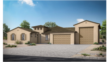
Elevation Spanish with optional RV Garage