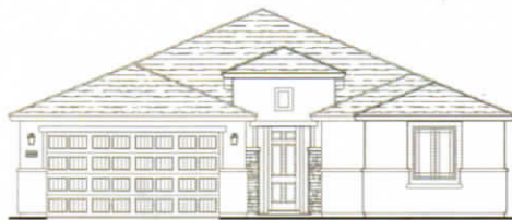
Elevation C with Stone