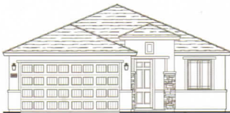
Elevation C with Stone