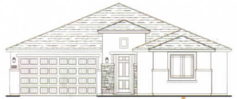
Elevation C with Stone