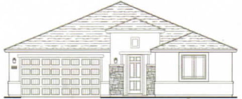
Elevation C with Stone