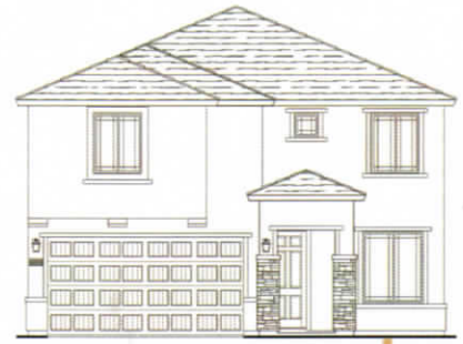
Elevation C with Stone