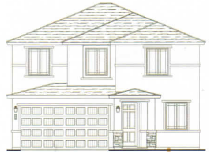
Elevation C with Stone