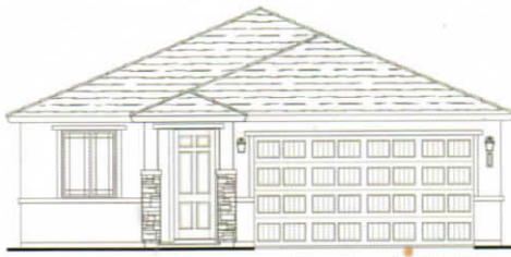
Elevation C with Stone