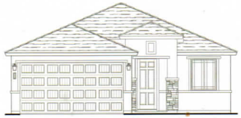
Elevation C with Stone