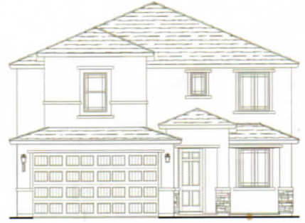
Elevation C with Stone