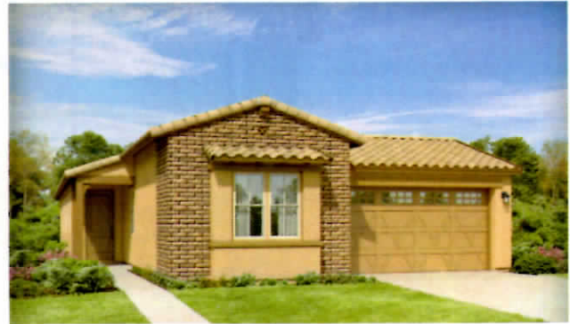
Elevation H | Ranch Hacienda