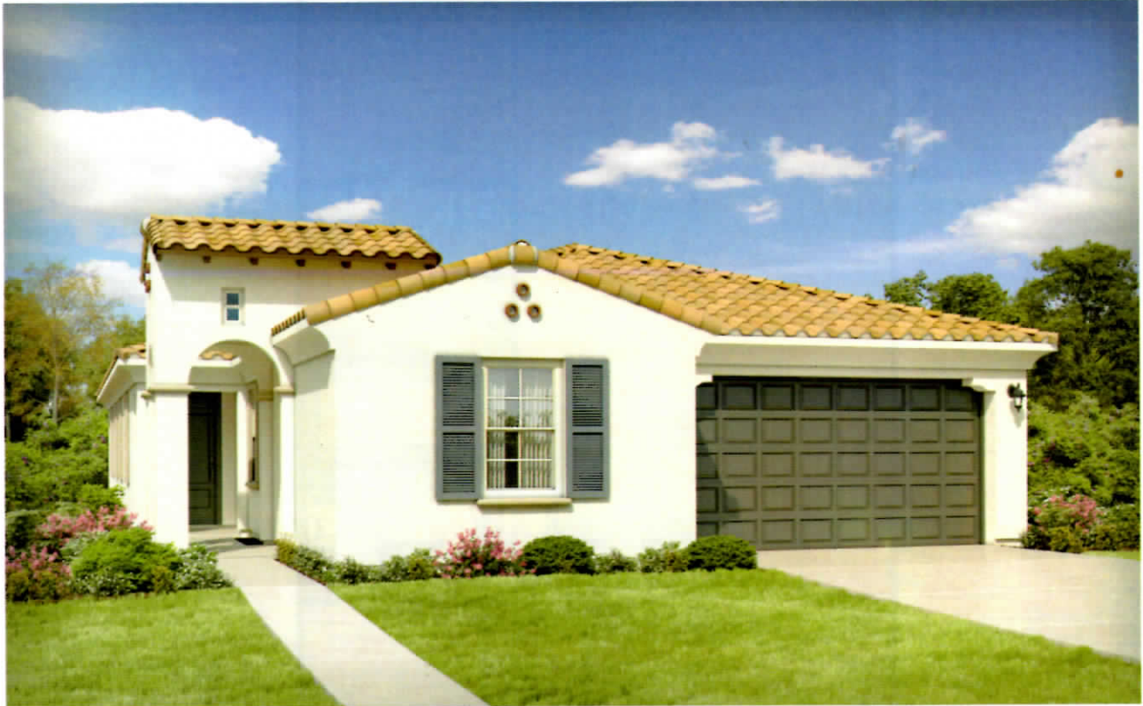
Elevation A | Spanish Colonial

Spruce | Plan 4024 | Approx. 2,472 sq. ft. 4 Bedrooms | Study | 3.5 Baths | 2-Bay Garage