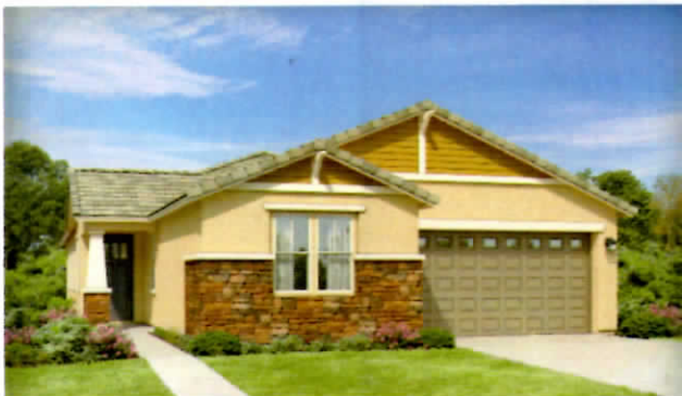
Elevation C | Craftsman