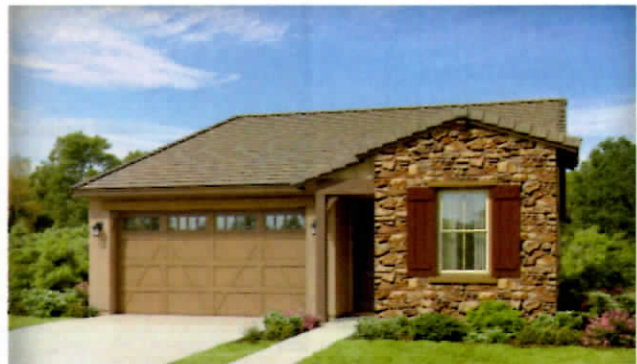
Elevation I | Western Territorial