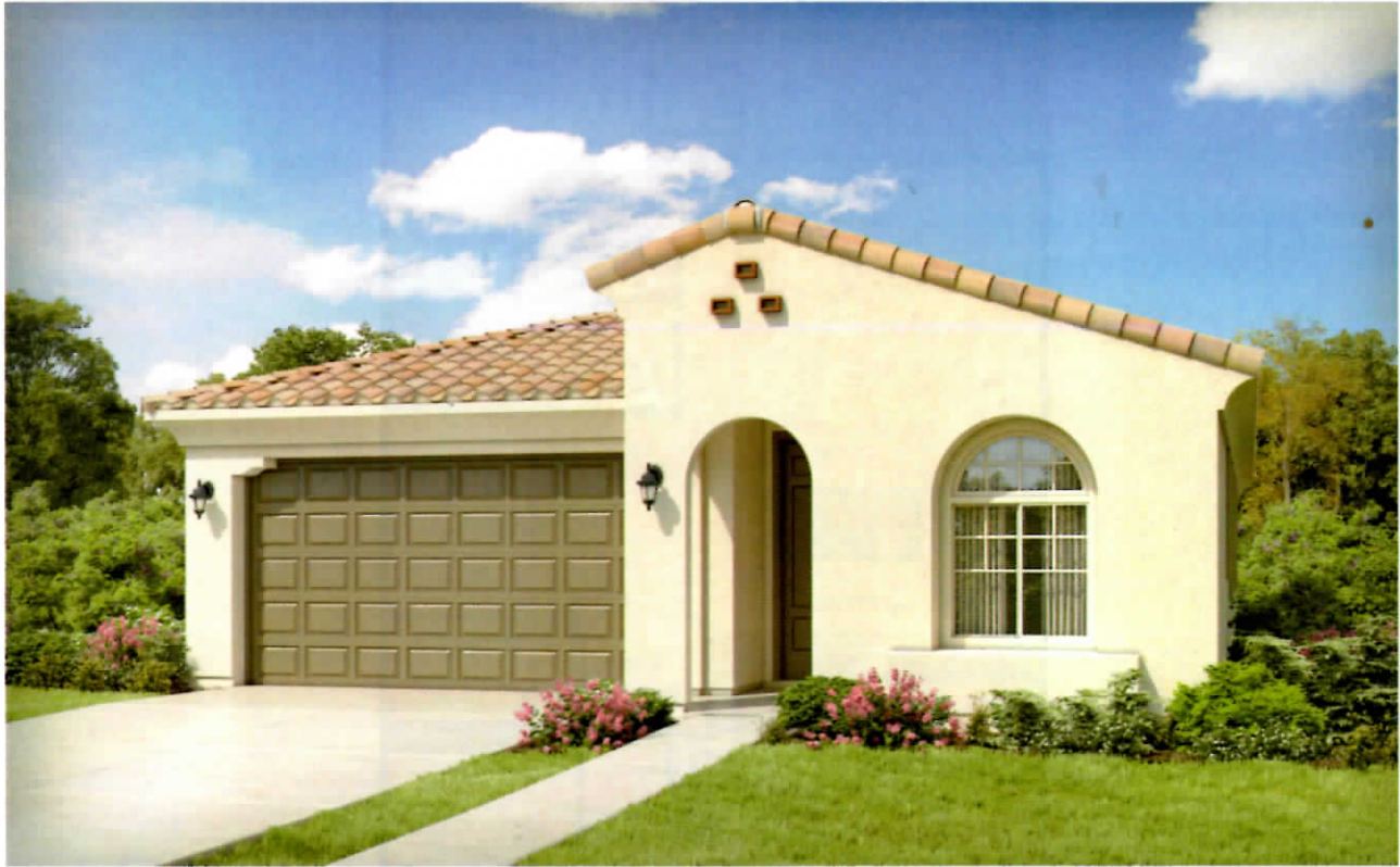
Elevation A | Spanish Colonial

Ironwood | Plan 3518 | Approx. 1,943 sq. ft. 4 Bedrooms | 3 Baths | 2-Bay Garage