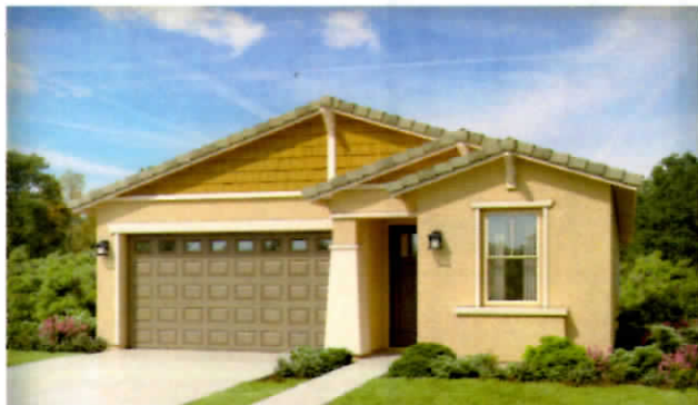
Elevation C | Craftsman