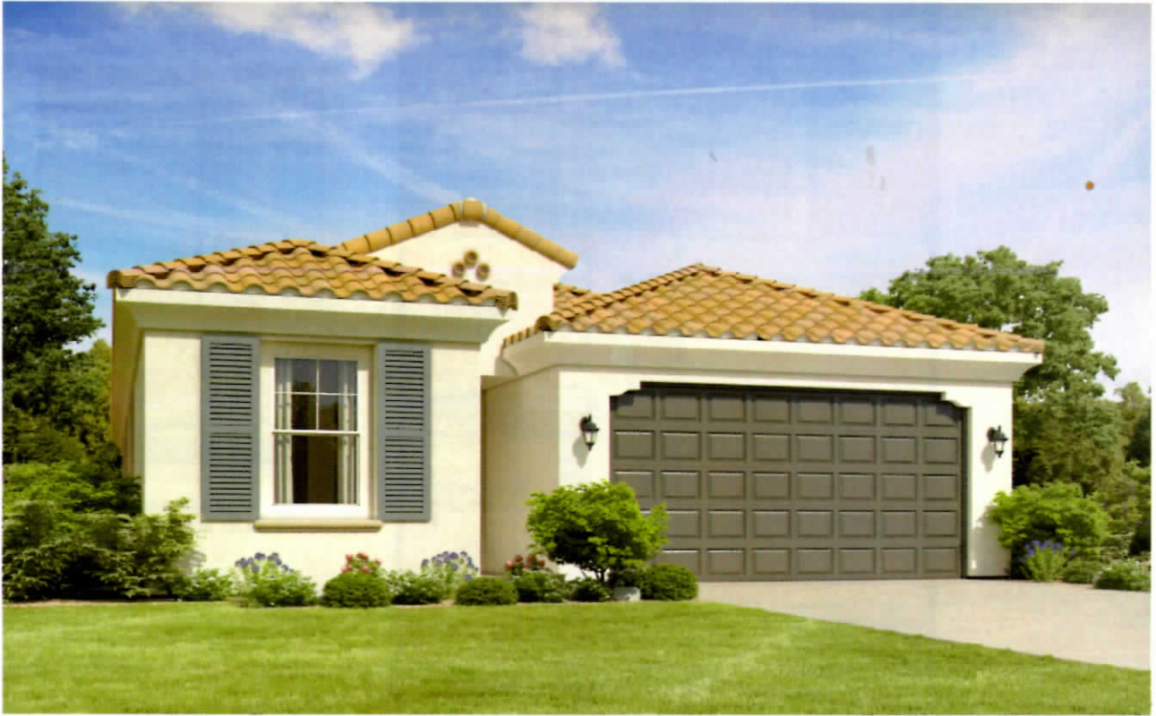
Elevation A | Spanish Colonial

Lewis | Plan 3575 | Approx. 1,951 sq. ft. 5 Bedrooms | 3 Baths | 2-Bay Garage