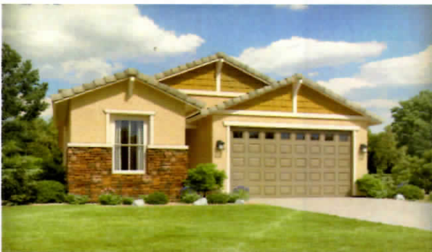
Elevation C | Craftsman