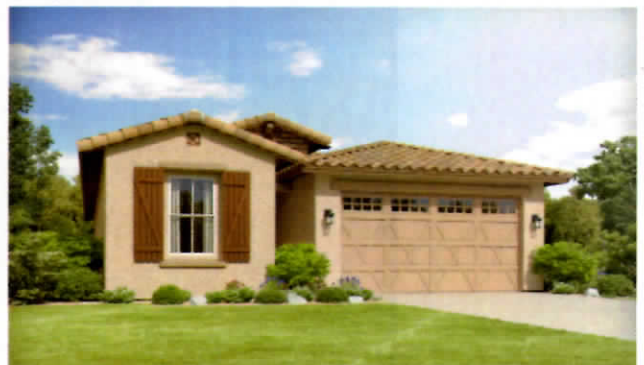
Elevation H | Ranch Hacienda