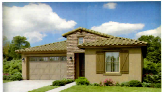
Elevation H | Ranch Hacienda