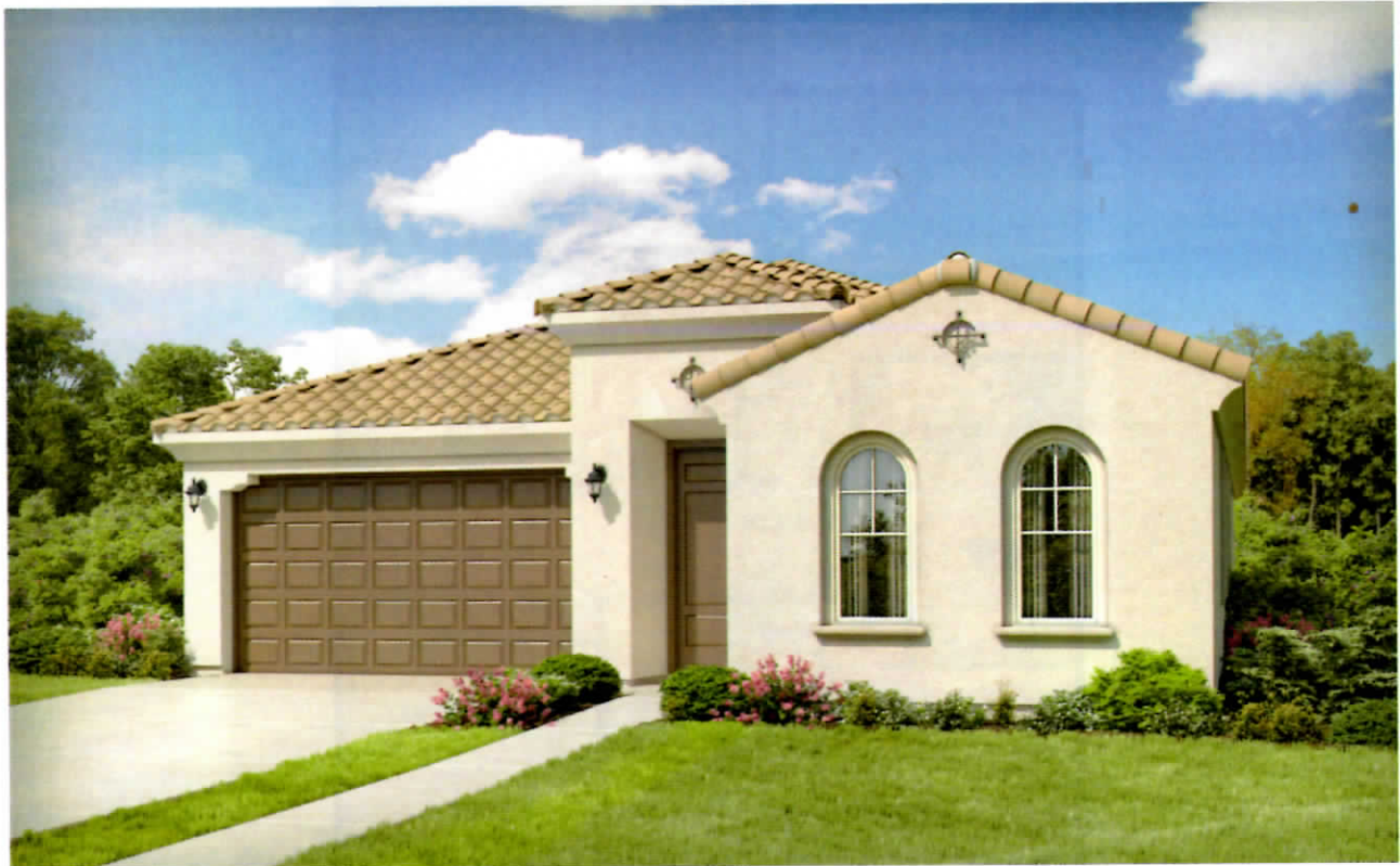
Elevation A | Spanish Colonial

Sage | Plan 4022 | Approx. 2,273 sq. ft. 4 Bedroom | 3 Bath | 2-Bay Garage