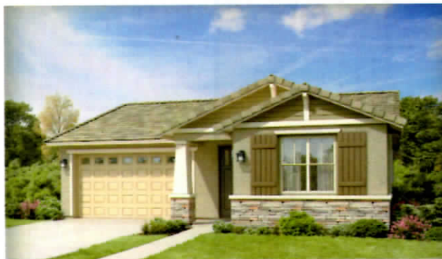
Elevation C | Craftsman