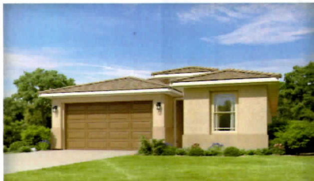
Elevation L | Desert Prairie