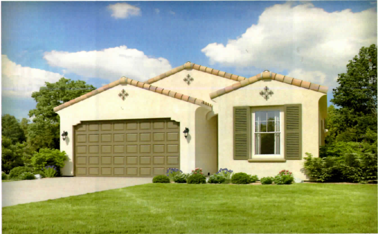
Elevation A | Spanish Colonial

Independence | Plan 3576 | Approx. 1,953 sq. ft. 3 Bedrooms | 3 Baths | 2-Bay Garage Main Home 1,405 sq. ft. | Priving Living Suite 548 sq. ft.