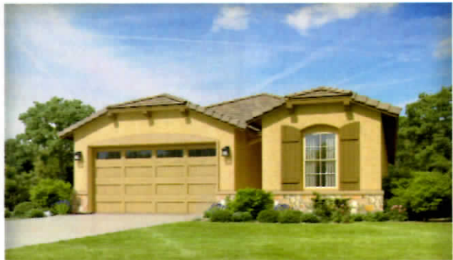
Elevation M | Cottage