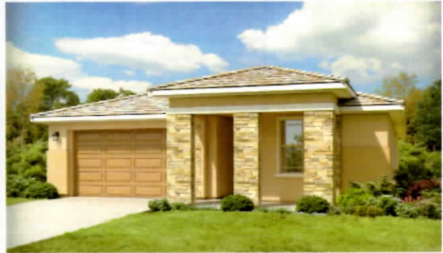
Elevation L | Desert Prairie