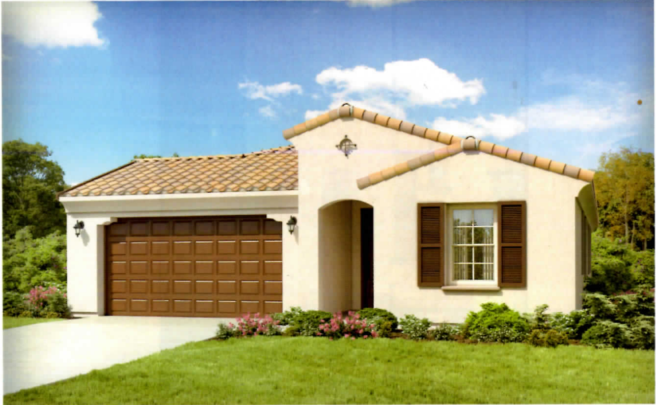
Elevation A | Spanish Colonial

Douglas | Plan 4021 | Approx. 2,192 sq. ft. 4 Bedrooms | 3 Baths | 2-Bay Garage