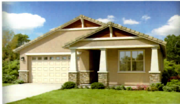
Elevation C | Craftsman