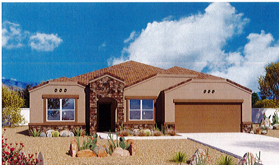
Elevation C Shown with Standard Color Blocking Standard LedgeStone Available