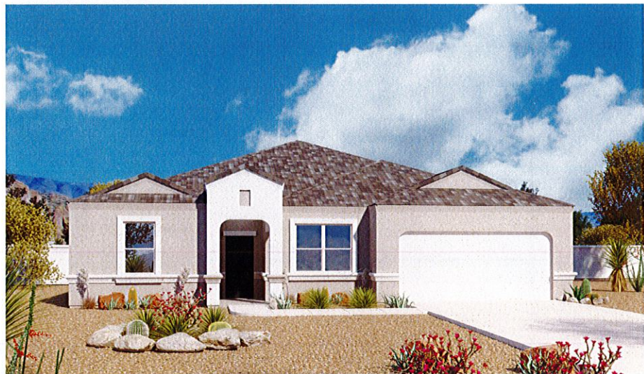
Elevation B Shown with Standard Color Blocking