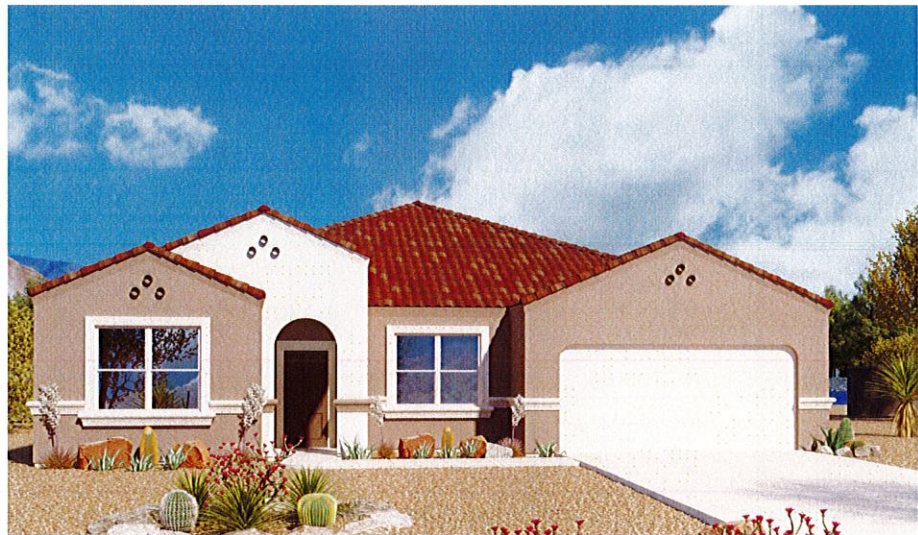
Elevation B Shown with Standard Color Blocking