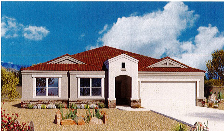
Elevation C Shown with Standard Color Blocking Standard LedgeStone Available