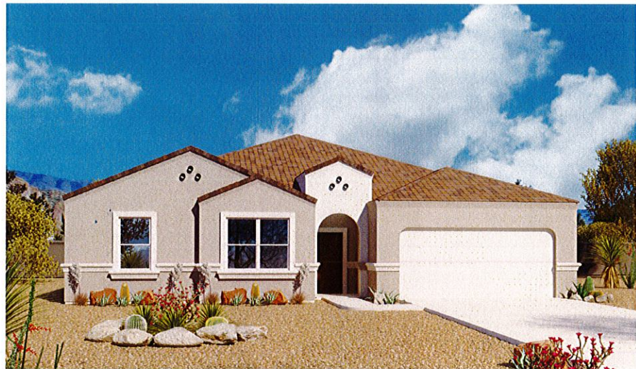
Elevation B Shown with Standard Color Blocking