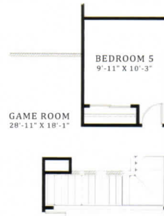
OPTIONAL BEDROOM 5

D.R. Horton is an Equal Housing Opportunity Builder. © 2009 DRH Properties, Inc, Broker. Location, size, existence of doors, windows, walls, fireplaces, cabinets and any other item depicted may vary depending on exterior preference, choice of options, or by subdivision. Home and community information, including pricing, included features, terms, availability and amenities, are subject to change and prior sale at any time without notice or obligation. Renderings are for illustration purposes only and may vary from the homes as built. Square footage dimensions are approximate. Other restrictions may apply. See sales representative for more information. Construction by DRH Construction Company, License #ROC 113105-B.