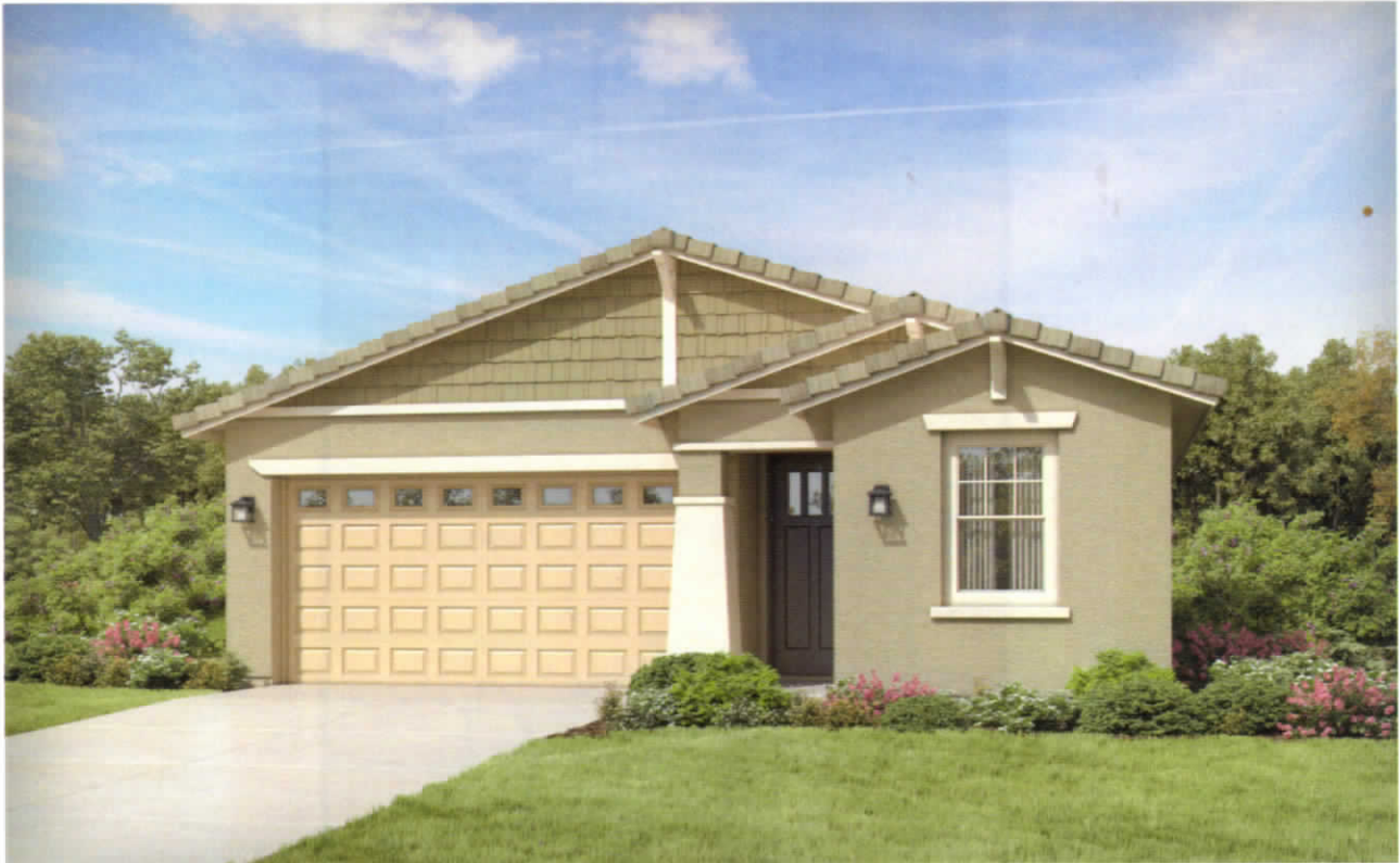
Elevation C | Craftsman

The Ironwood | Plan 3518 | Approx. 1,946 sq. ft. 4 Bedrooms | 3 Baths | 2-Bay Garage