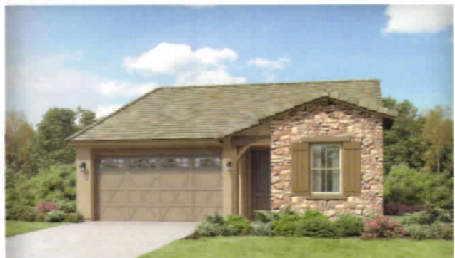
Elevation I | Western Territorial