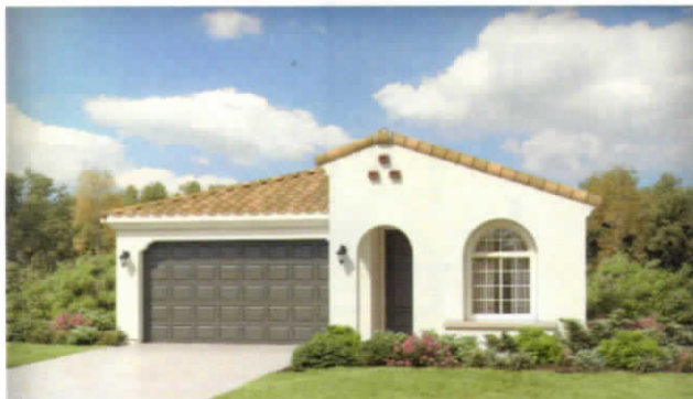
Elevation A | Spanish Colonial