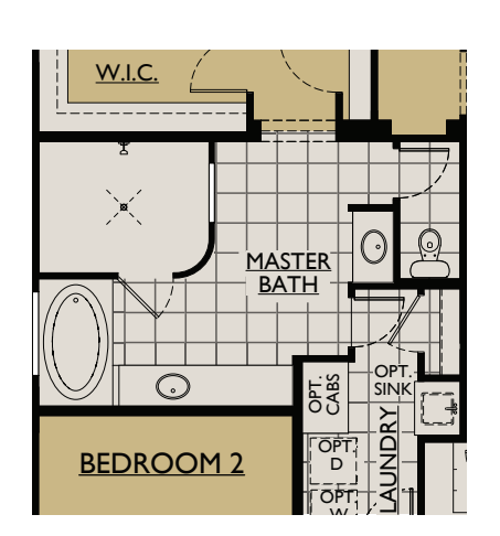
OPT. OVERSIZED MASTER SHOWER

Dimensions are approximate, may differ from actual plans and are subject to change without notice. Floor plans vary per elevation and community. Images may not be shown to scale. Windows, doors and ceilings may vary on options and alternate elevations selected. Specifications, equipment, plans and pricing are subject to change without notice. Renderings (elevations and landscaping) are artist's conception only. Some optional features may or may not be shown. Optional items indicated are available at additional cost. This brochure is for illustrative purposes only and not part of a legal contract. Speak with a William Ryan Homes Sales Representative for complete information. Copyright © 2014 William Ryan Homes, Inc. All Rights Reserved.