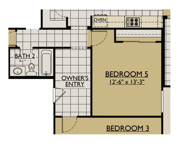
OPT. BEDROOM 5 ILO DEN