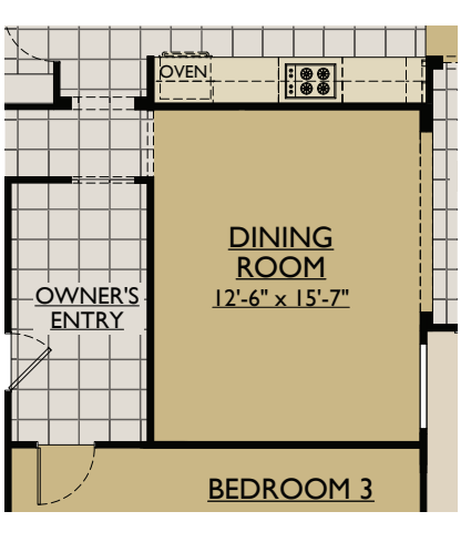
OPT. DINING ROOM ILO DEN